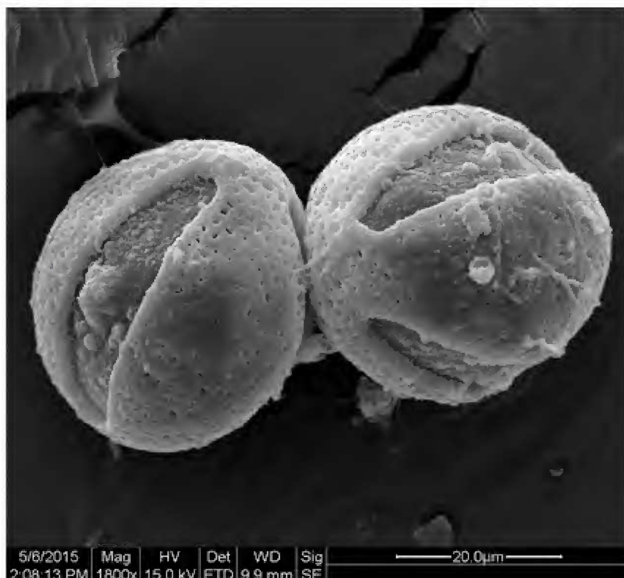
Fig 1. Photomicrographs of pollen grains of Phanera glabrifolia Benth. var. glabrifolia (from the type specimen – CAL11293).

Manuscript received 19 June 2015, accepted 23 June 2015